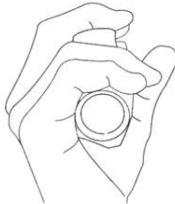
STEP - 2