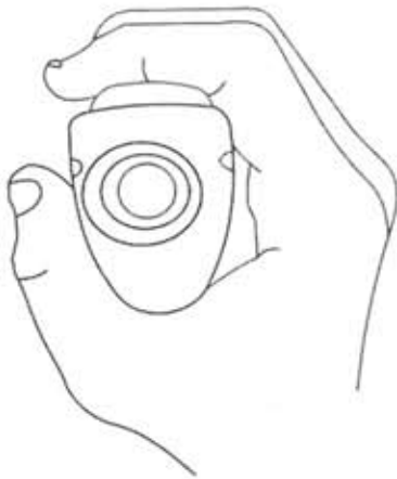
STEP - 1