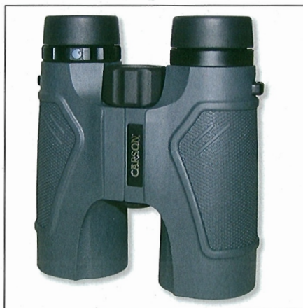
CARSON OPTICAL 3D Series Binoculars

Six colours and three sizes – 3.9in, 2.9in and 1.9in – are available.