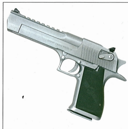
MAGNUM RESEARCH Mark XIX Desert Eagle .50AE Pistols

Precisely placed thumb grooves and improved ergonomics ensure that this product is comfortable to hold.