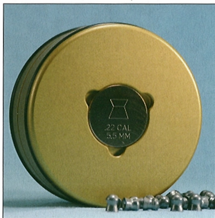
PELLCAN Airgun Pellet Containers

Gun Trade World, 2 Stephenson Close, Drayton Fields, Daventry, Northants, UK NN11 8RF